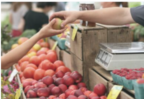
Can the primary sector afford better working conditions? Evidence from a survey experiment in Greece