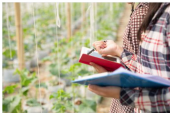
Learning about farmers' willingness to cooperate through public goods games in four EU member states